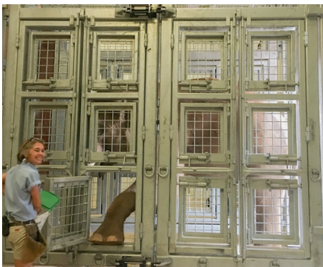
Multiple Access Doors for Flexibility in Training