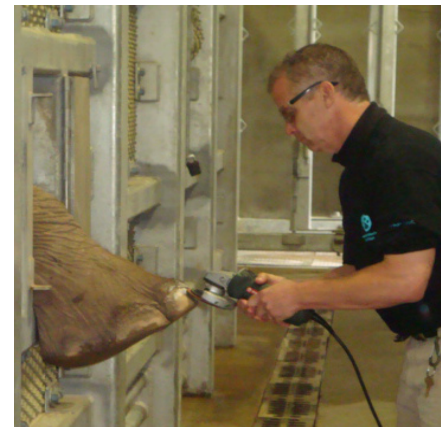
Numerous Access Points for Foot Care

Foot Portals: Several access points with movable rods to provide adjustable space for full spectrum foot care